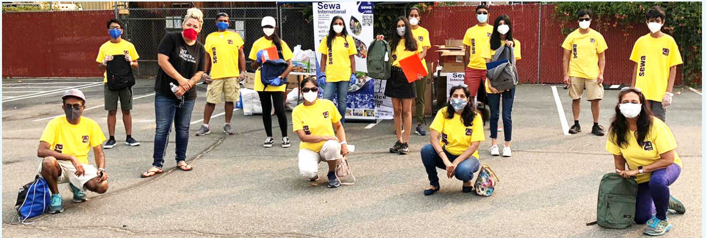
Bay Area volunteers getting ready to conduct a Food Drive on August 29, 2020 in Oroville, CA