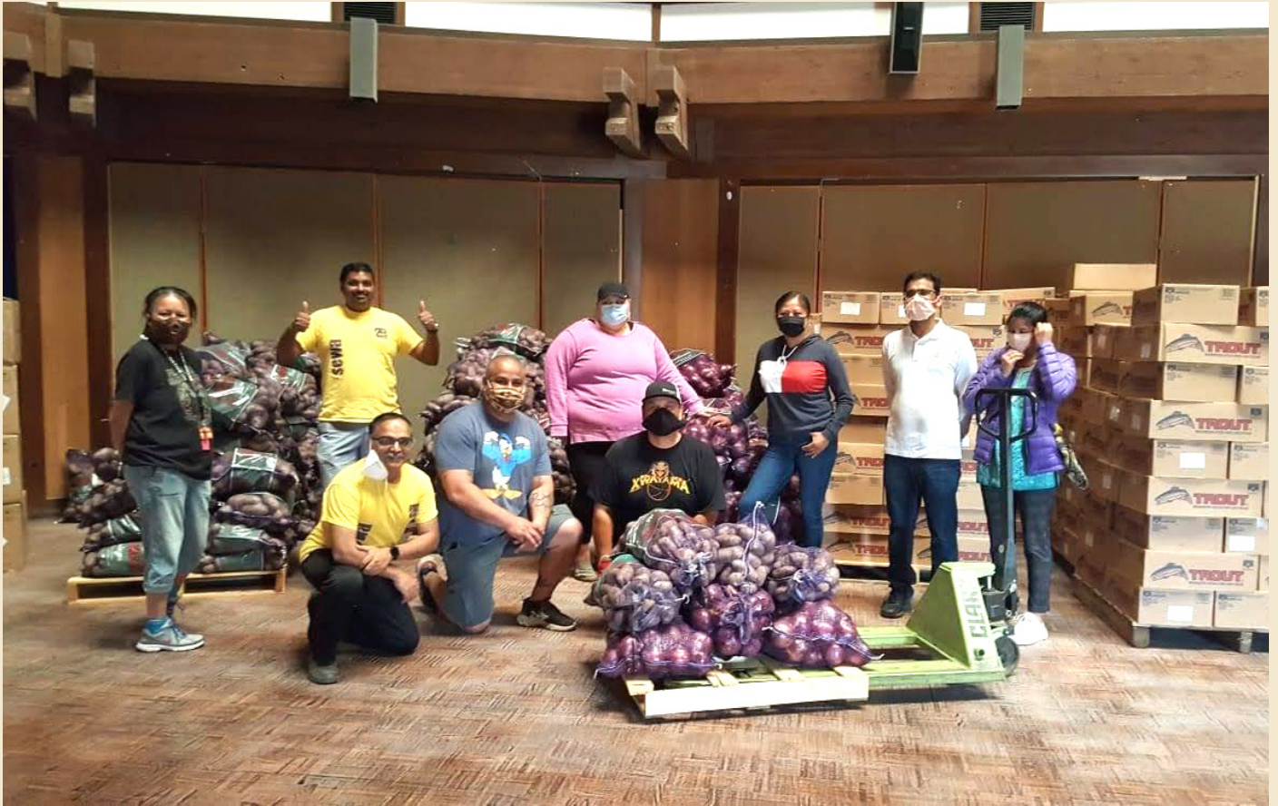
Sewa volunteers & Native American Community Members prepared boxes and bags of vegetables to ship to the Navajo Nation Native American Community.

While the outbreak of COVID-19 has sparked concern all over the world, Native American communities are among those that have been hit the hardest, with some of the highest known infection rates in the world. These vulnerable communities live in isolated areas and are unable to access essential services during this time. In response to their needs, Sewa International is collaborating with International Center for Cultural Studies (ICCS) and is in direct communication with the tribal leaders of the Navajo Nation, Yakama Nation, and other Native American communities in the U.S. to provide them with critical supplies and help them fight the pandemic.