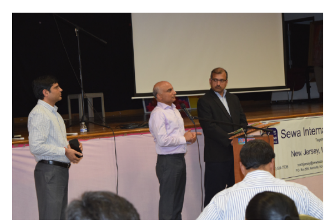
Speakers and Reception Desk